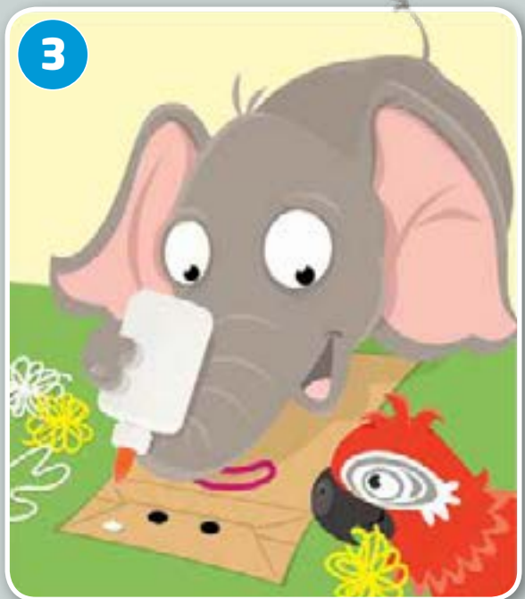
Glue on hair.