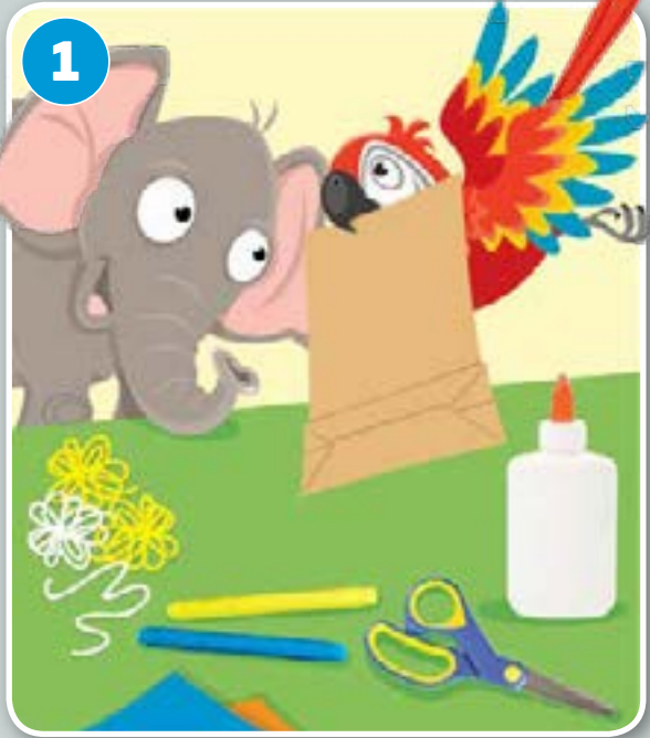
Use a folded paper bag.