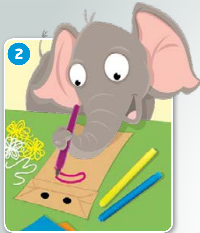
Draw a face. Glue shapes.