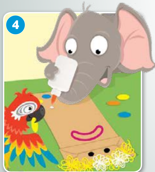
Decorate the clothes.

This is my puppet. His name is Sam. He's sad.