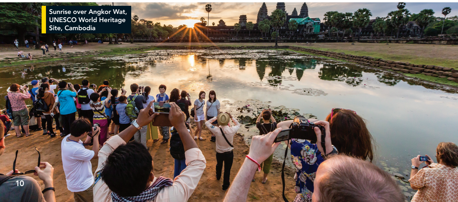
Sunrise over Angkor Wat, UNESCO World Heritage Site, Cambodia