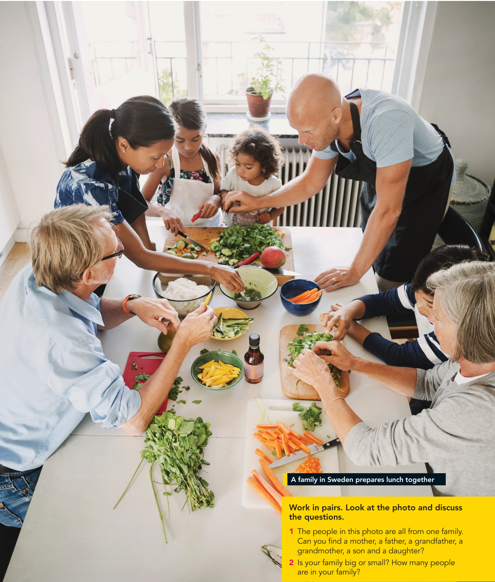
A family in Sweden prepares lunch together

Work in pairs. Look at the photo and discuss the questions.