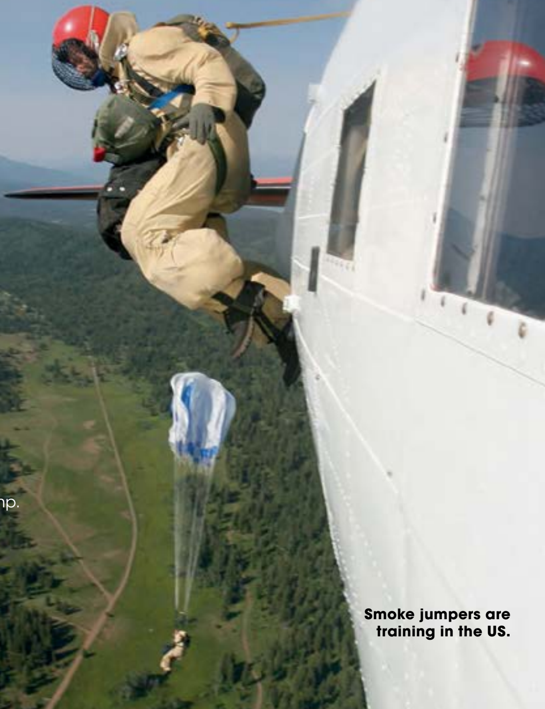
Smoke jumpers are training in the US.