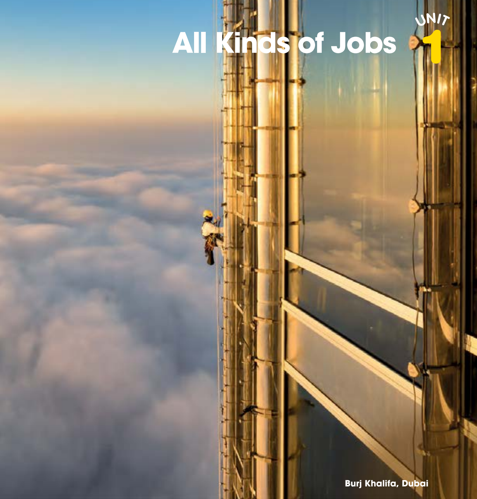
Burj Khalifa, Dubai

Look at the photo. Answer the questions.