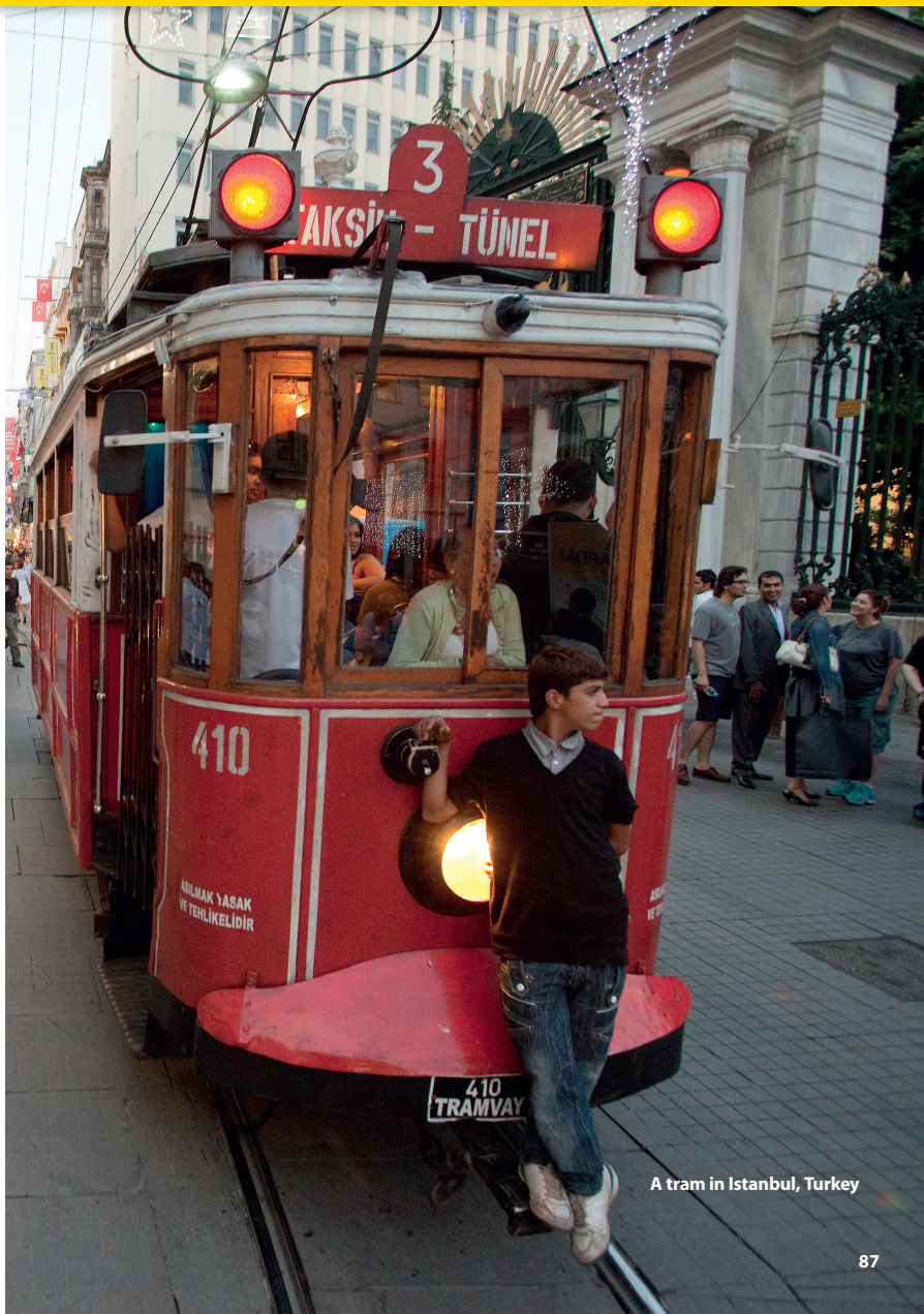
A tram in Istanbul, Turkey