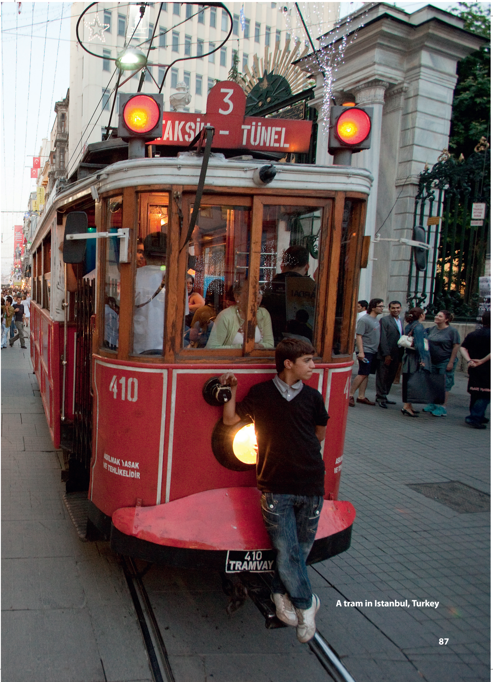
A tram in Istanbul, Turkey